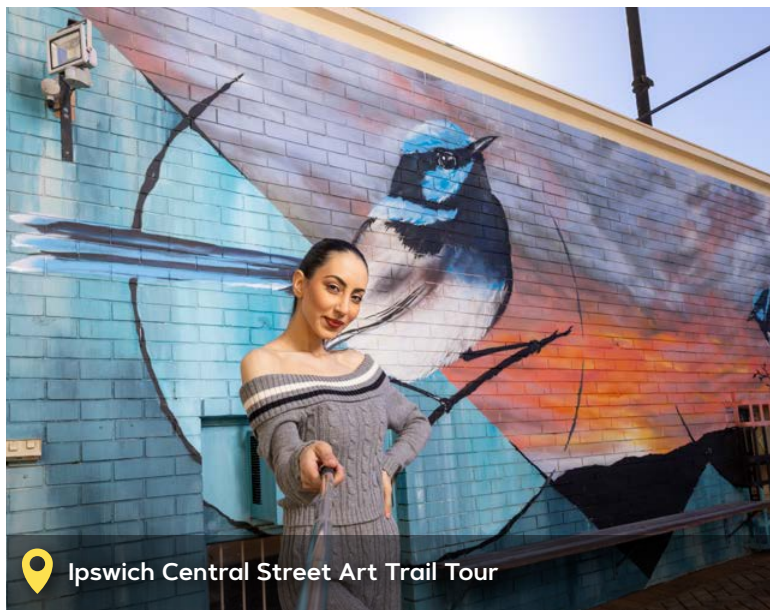
Ipswich Central Street Art Trail Tour

Bookings for tours usually require a minimum of 20 people and can be booked Monday–Friday. For bookings call (07) 3281 0555 or email info@discoveripswich.com.au